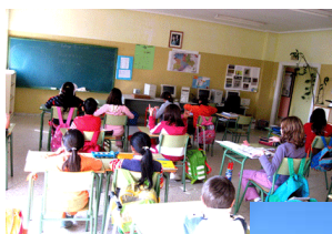
Classroom of Primary

There are 32 students in this school and three teachers.